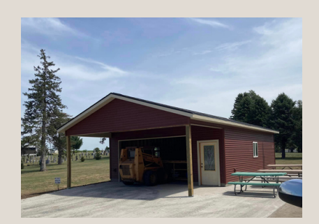
The New Garage

Once again our Church and Cemetery have been shown some love this year. The garage is FINISHED! Cupboards were donated in exchange for taking them out of a home. Garage doors were put on and a fresh coat of paint put on the inside. Extra cement was poured around the building to help with erosion and maintenance. The donated refrigerator, freezer, airconditioner and heater have already come in very handy. The garage has worked great for the fundraising events when we grill - Memorial Day, Car Show and Tractor Show. Tables and chairs were donated and are being put to good use during our 150th Celebration meetings and